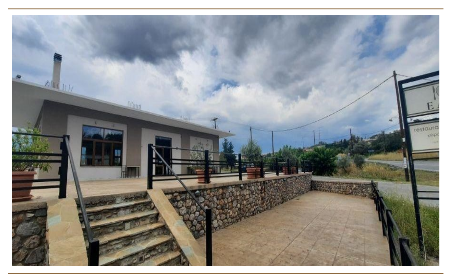
KAUFPREIS: 750.000 EUR • GRUNDSTÜCK: 2.400 m<sup>2</sup>